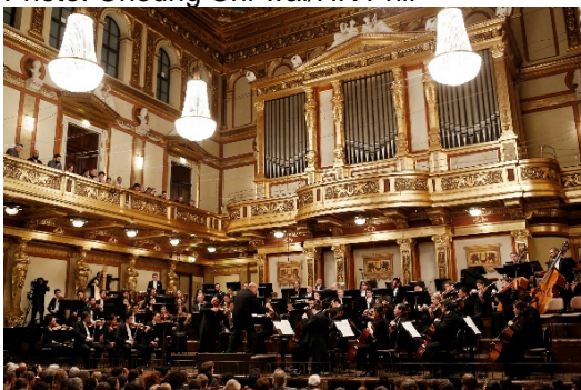
Europe Tour: Vienna. Featuring violinist Ning Feng (26 February 2015)