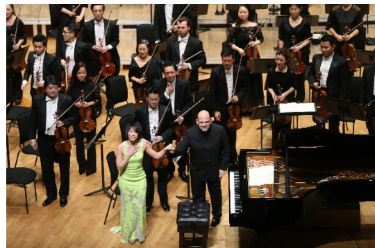
Yuja Wang Triptych 1 – Mozart: A Celebration of the 18 th Anniversary of the Establishment of the HKSAR (12 June 2015)