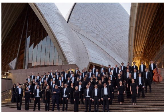
HK Phil Tour 2017: Sydney (5 May 2017)