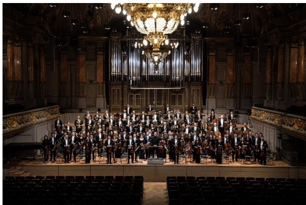
Singapore and Europe Tour: Zurich (26 February 2024)