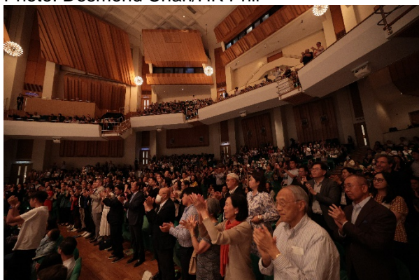
The audience bids an emotional farewell to Jaap van Zweden (25 June 2024)