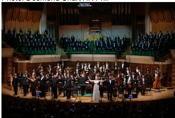
Opera in Concert: Jaap | The Flying Dutchman (21 June 2024)