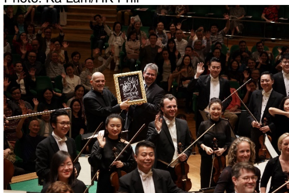
Sharing the joy of winning the prestigious Gramophone Orchestra of the Year Award at the “Jaap | Renée Fleming” concert (9 November 2019)