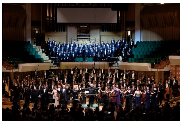
The Ring Cycle Part 4 – Götterdämmerung (18 January 2018)