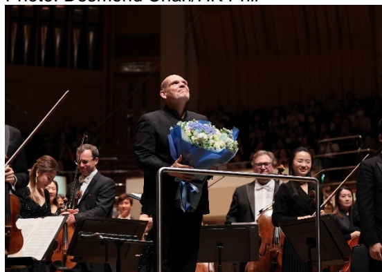
Farewell to Our Music Director (25 June 2024)