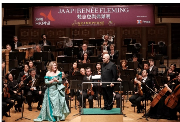
Jaap | Renée Fleming (8 November 2019)