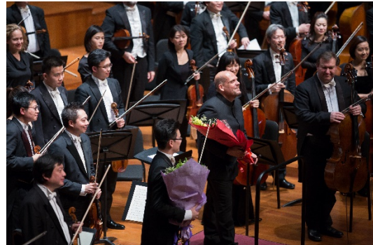
Mainland China Tour: Beijing (6 March 2014)