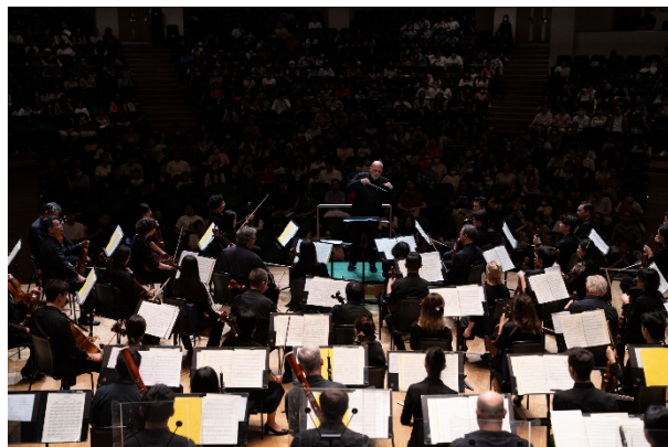
Swire Community Concert: Summertime, Party Time (15 June 2024)